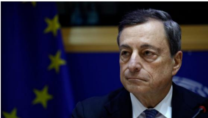
Former European Central Bank President Mario Draghi.