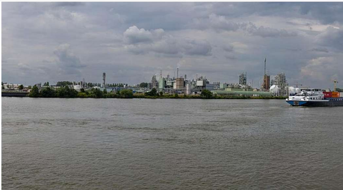
Chemours factory in Dordrecht, 21 July 2023

BUSINESS TECH NATURE PFAS CHEMICAL COMPANIES INVESTOR INITIATIVE ON HAZARDOUS CHEMICALS » MORE TAGS